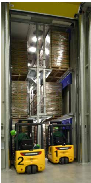
Three-storey ripening chamber

A highlight of our ripening chambers is their flexibility. We can erect the chambers so that they can be easily dismantled and re-erected elsewhere. Take advantage of our long-standing experience. Discuss your project with us and we will work out the right solution with you to suit your needs.