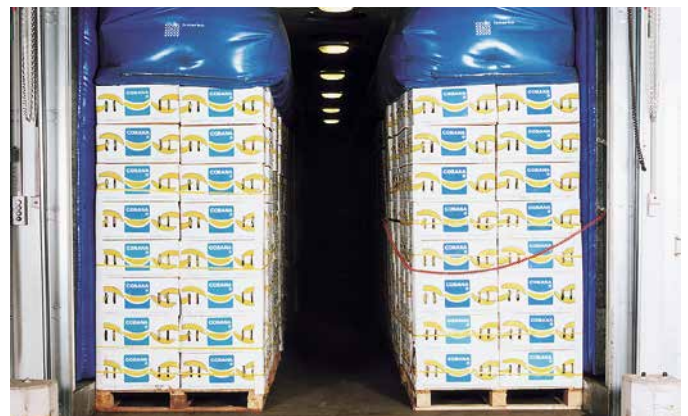
Ripening chamber, one-storey, with airbag system