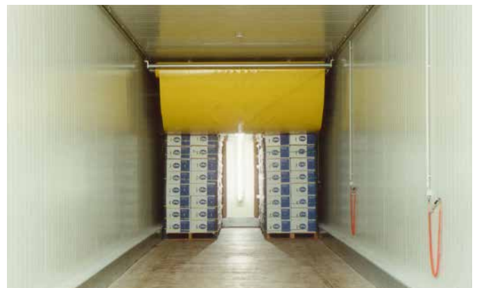
Ripening chamber, one-storey, with tarpaulin cover