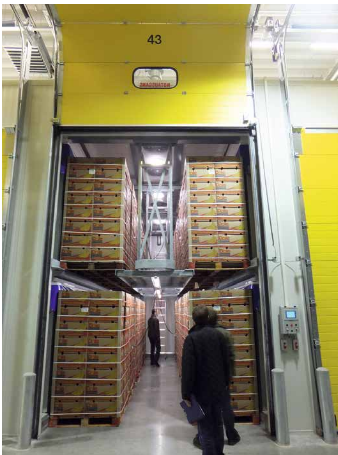
Ripening chamber, two-storey, with sectional door and side curtain