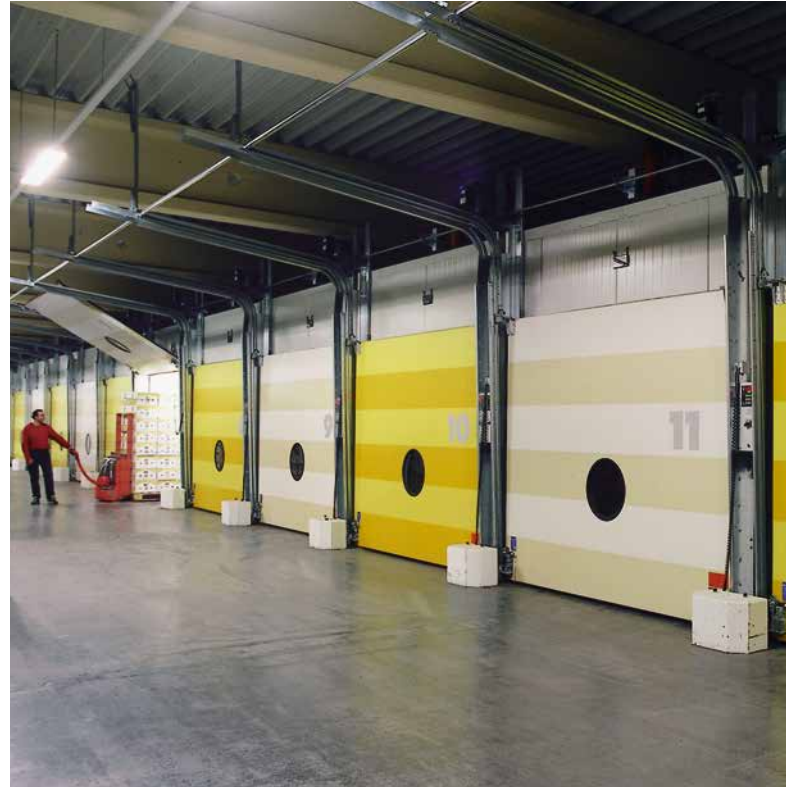
Ripening chamber, one-storey, with lift door

Our in-house developed gas-tight P+W lift doors are specially built as banana chamber doors in a highly insulated sandwich design at our factory.