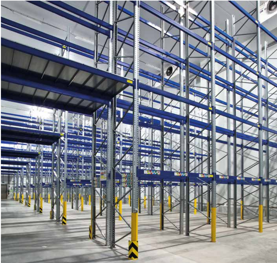
Shelf system solution outgoing goods warehouse