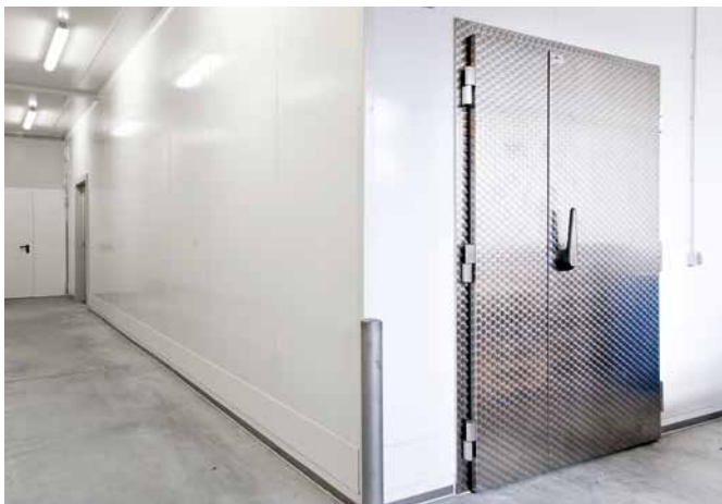
Refrigeration room revolving door, 2-leaf in stainless steel