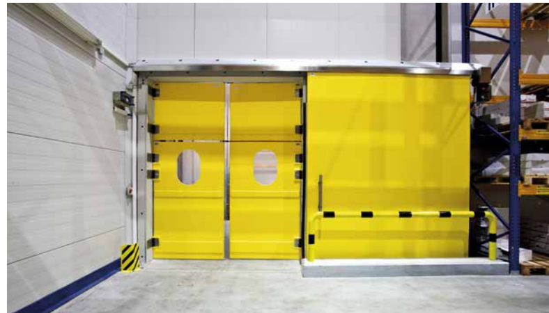
Freezer room sliding gate with 4-leaf PE swing door