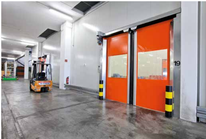
Horizontally opening high-speed doors